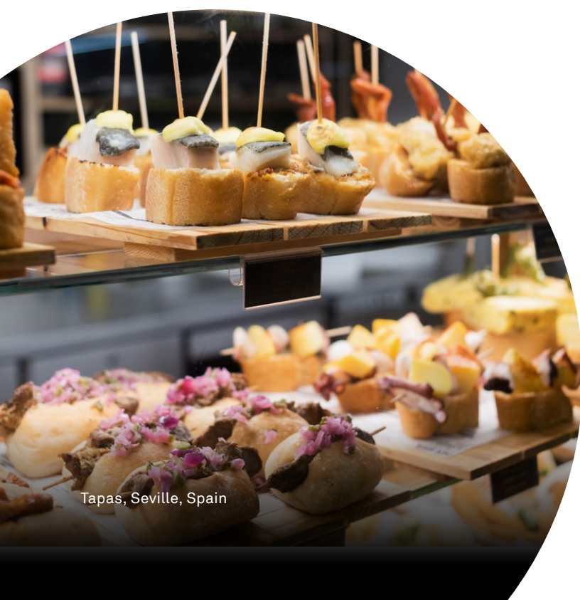
Tapas, Seville, Spain