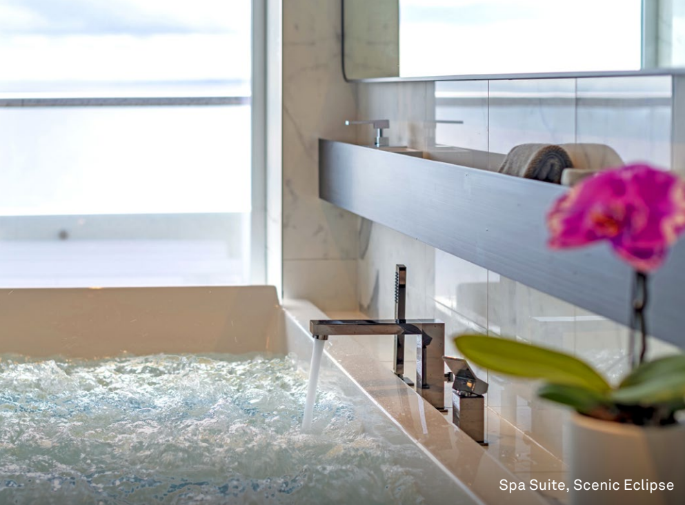
Spa Suite, Scenic Eclipse