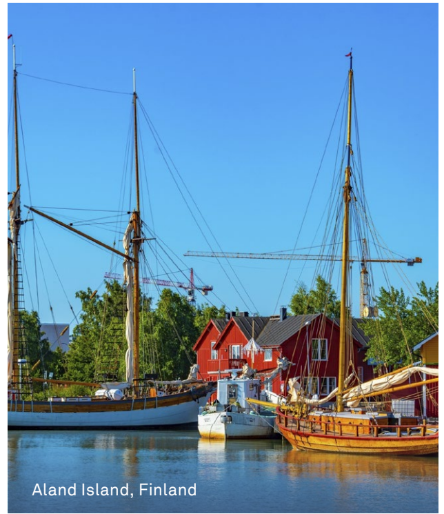
Åland Island, Finland