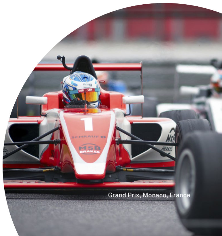
Grand Prix, Monaco, France

‡ Voyage does not include tickets to the Monaco Grand Prix tickets and will be available at an additional cost.