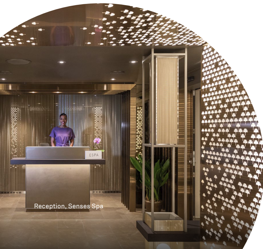
Reception, Senses Spa