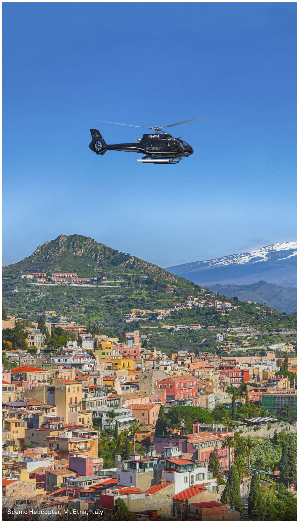
Scenic Helicopter, Mt Etna, Italy