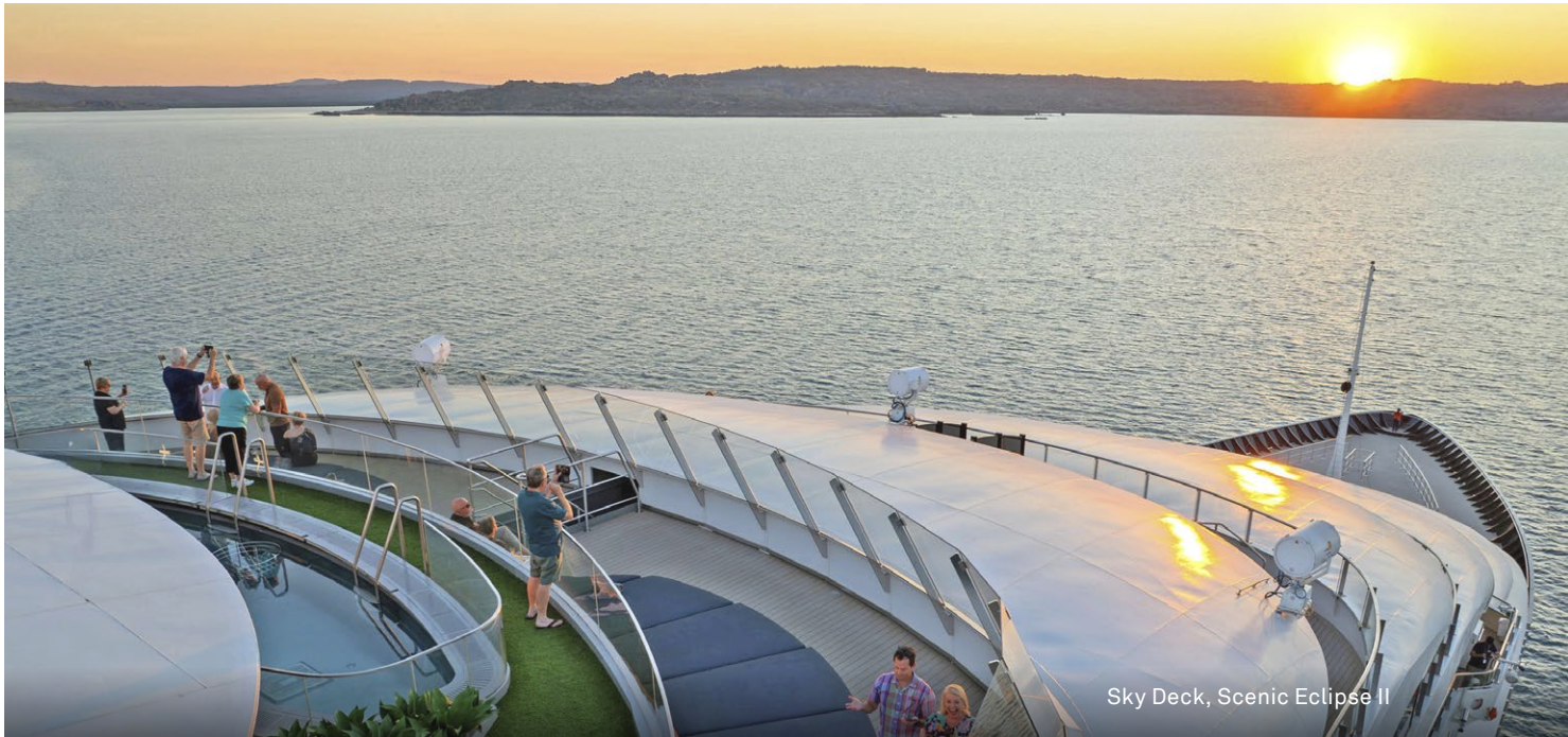
Sky Deck, Scenic Eclipse II