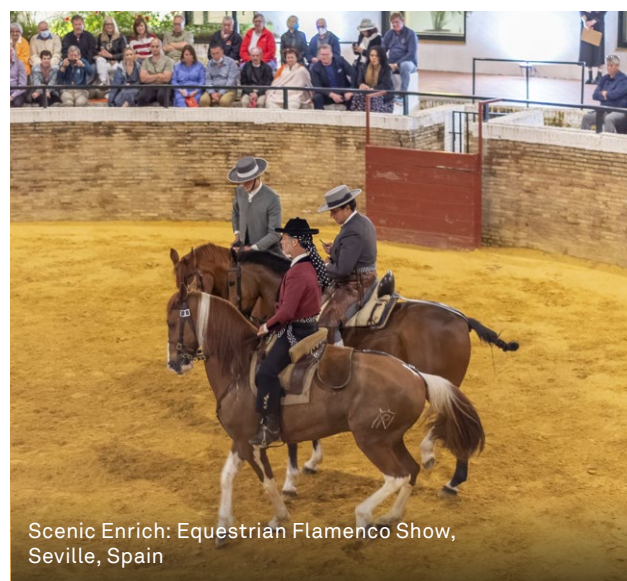
Scenic Enrich: Equestrian Flamenco Show, Seville, Spain

Your voyage will take you to some of the most stunning natural spectacles along the European and Mediterranean coastlines. From the golden beaches of Saint-Tropez to the windswept bluffs of Scotland, the captain and crew will select the most visually stunning coastal areas for you to be inspired.