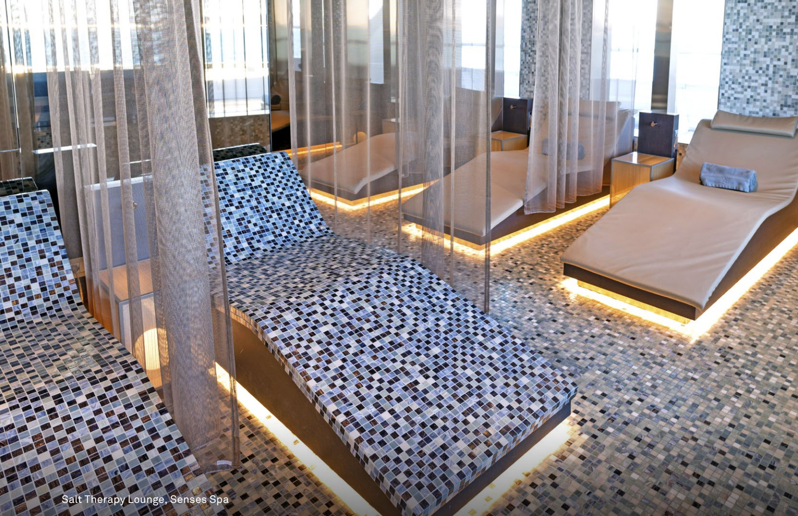
Salt Therapy Lounge, Senses Spa