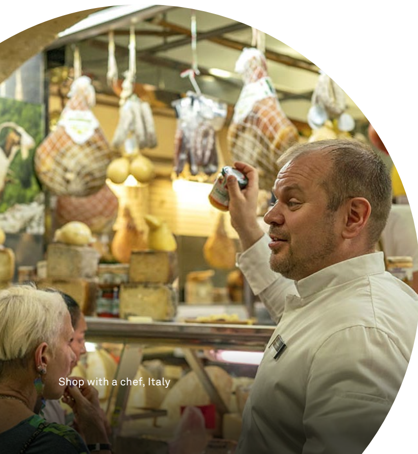
Shop with a chef, Italy