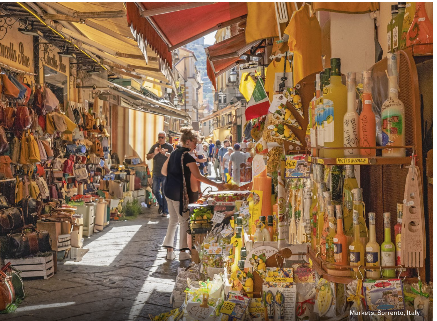
Markets, Sorrento, Italy