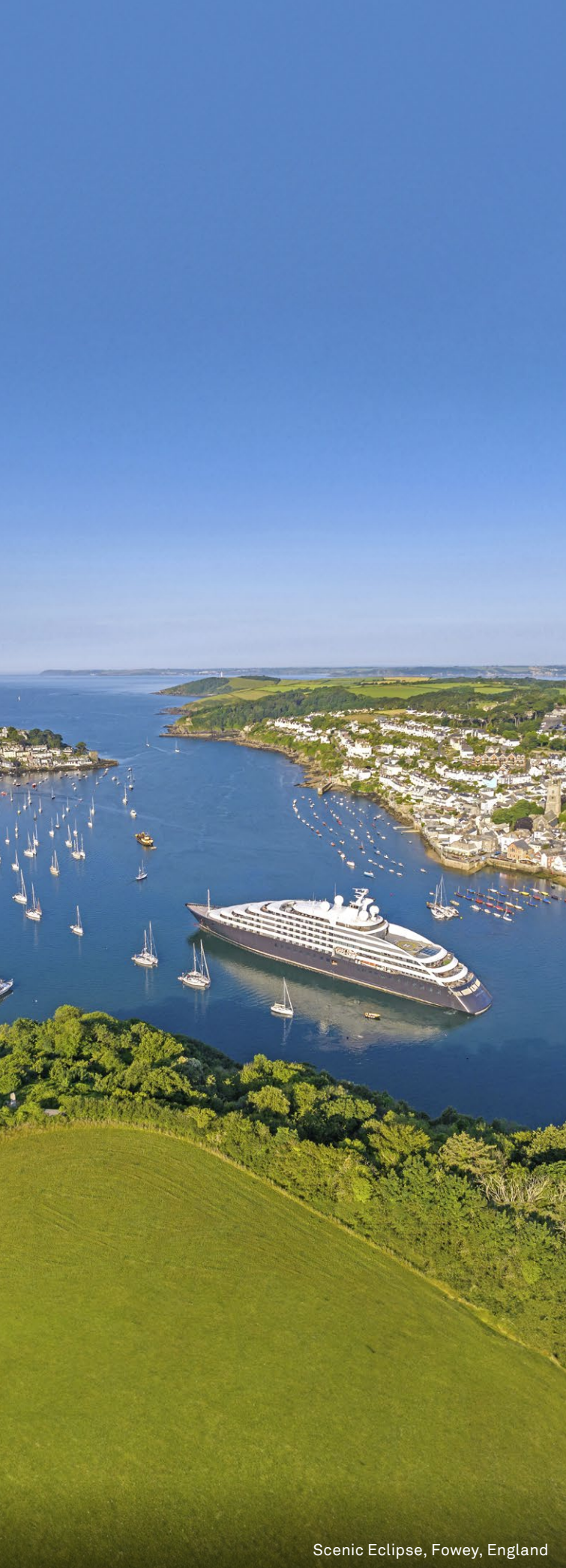
Scenic Eclipse, Fowey, England