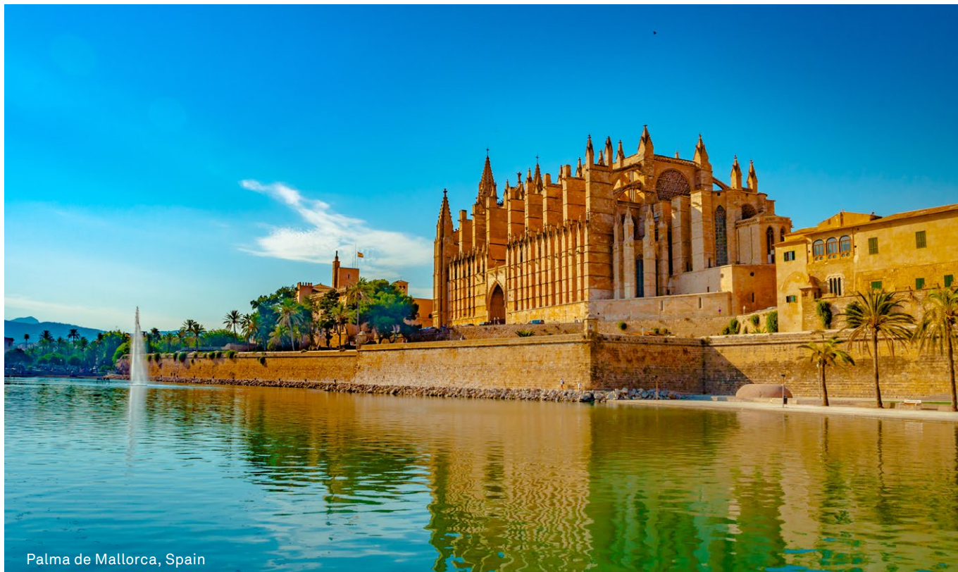
Palma de Mallorca, Spain