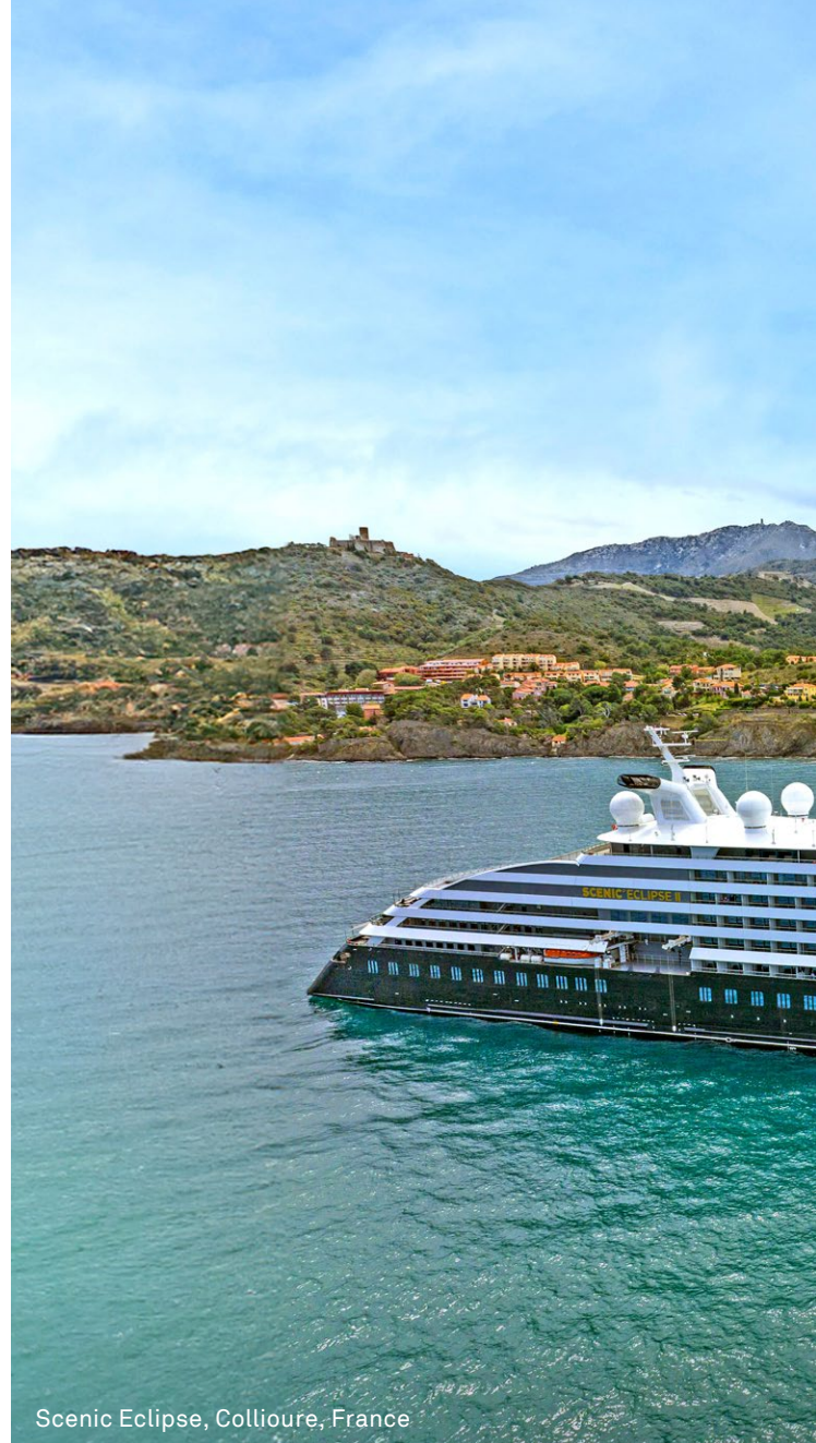
Scenic Eclipse, Collioure, France

Explore these magnificent rivers as part of unique itineraries on board Scenic Eclipse, on a range of new voyages in 2026.