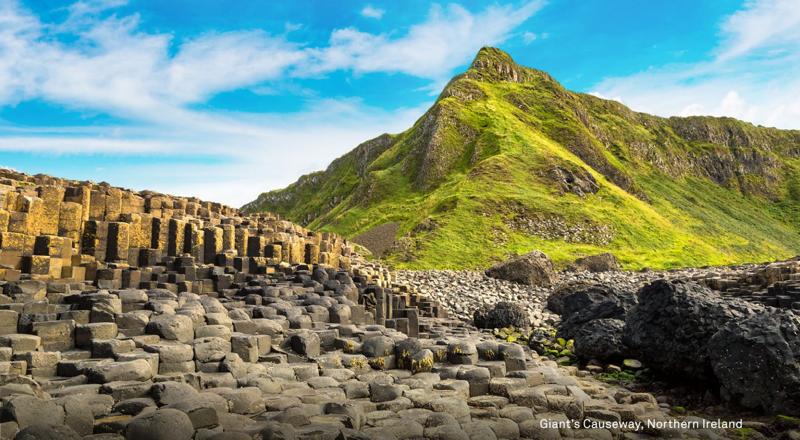
Giant's Causeway, Northern Ireland