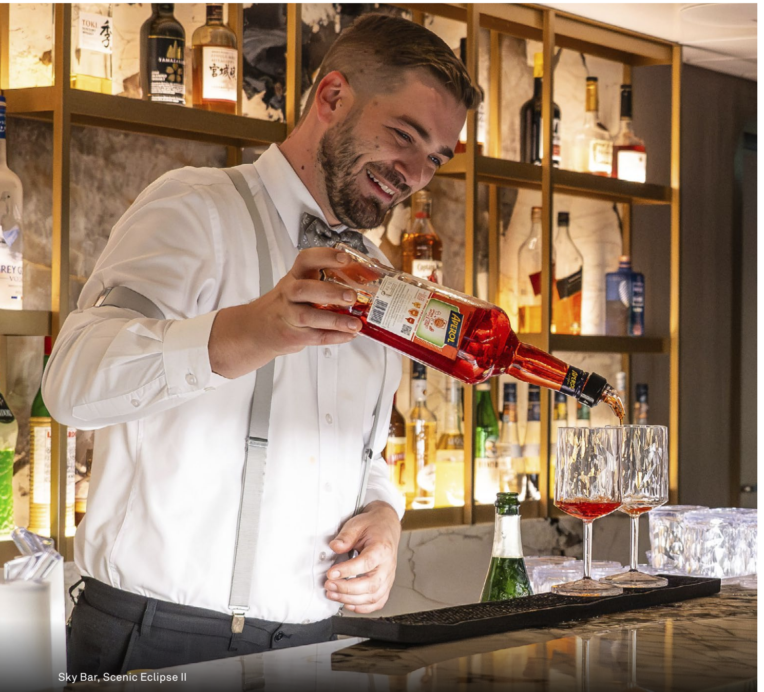
Sky Bar, Scenic Eclipse II