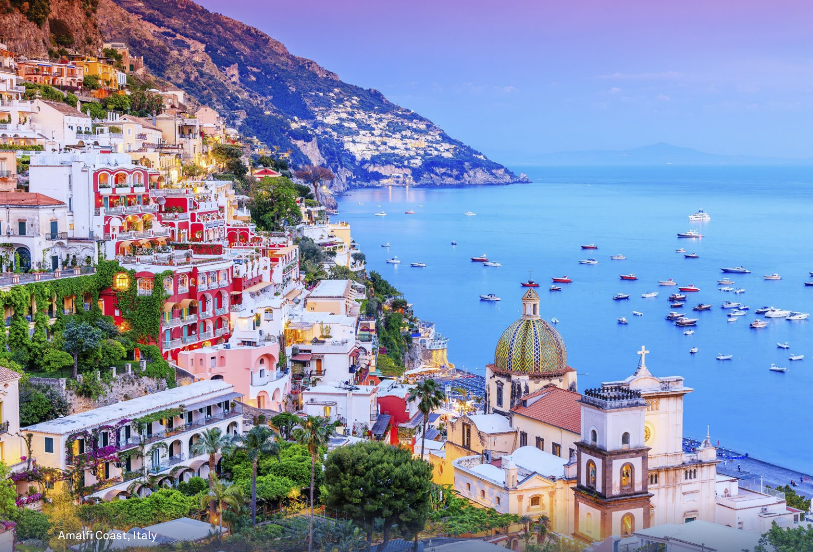
Amalfi Coast, Italy