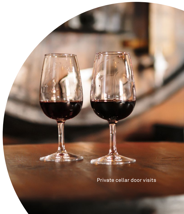
Private cellar door visits

You may also enjoy a shopping experience with the Chef at some of the finest local markets, for insights into how to choose the best produce while being immersed in local life.