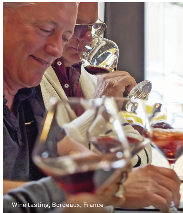
Wine tasting, Bordeaux, France