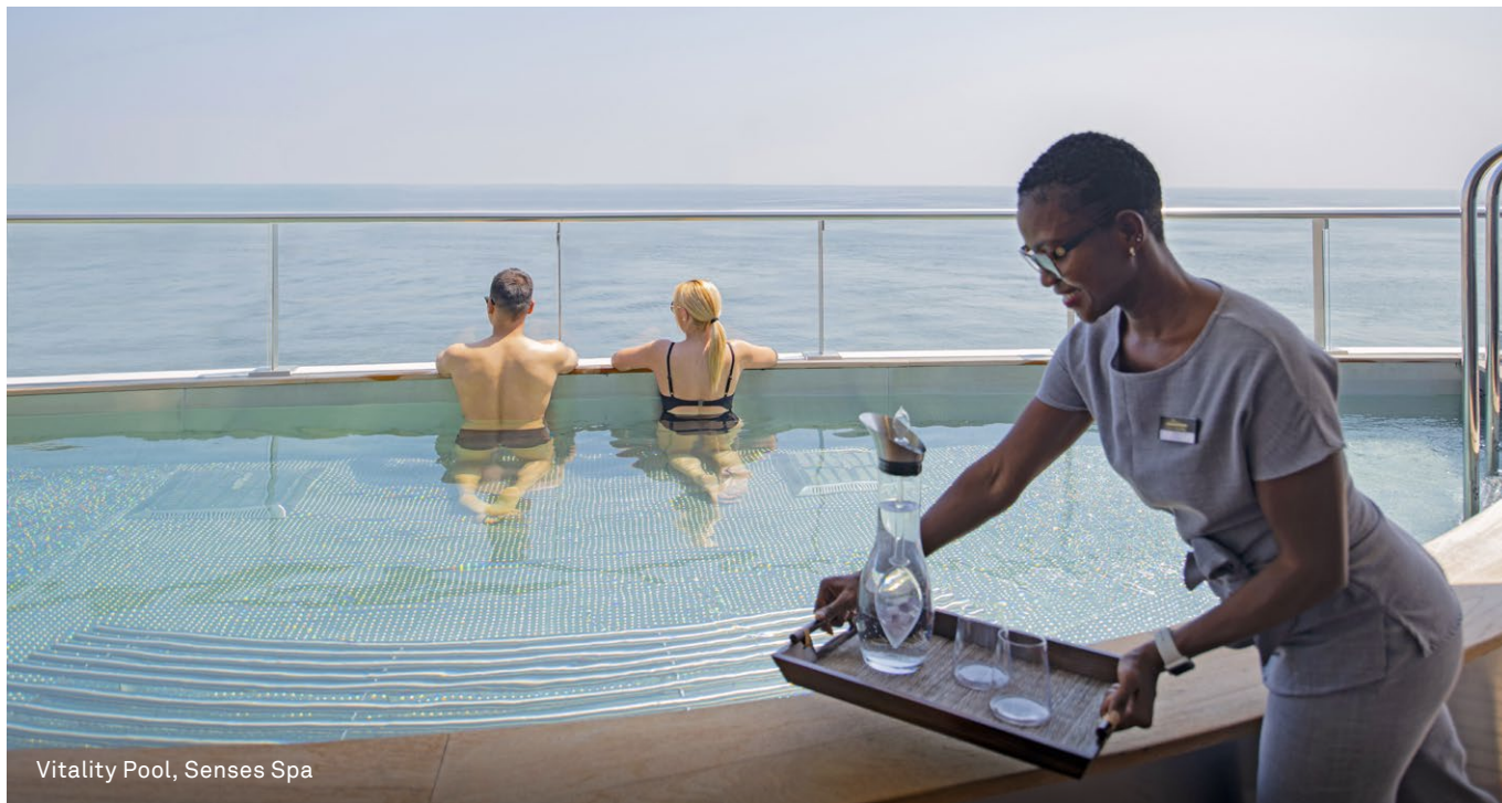
Vitality Pool, Senses Spa