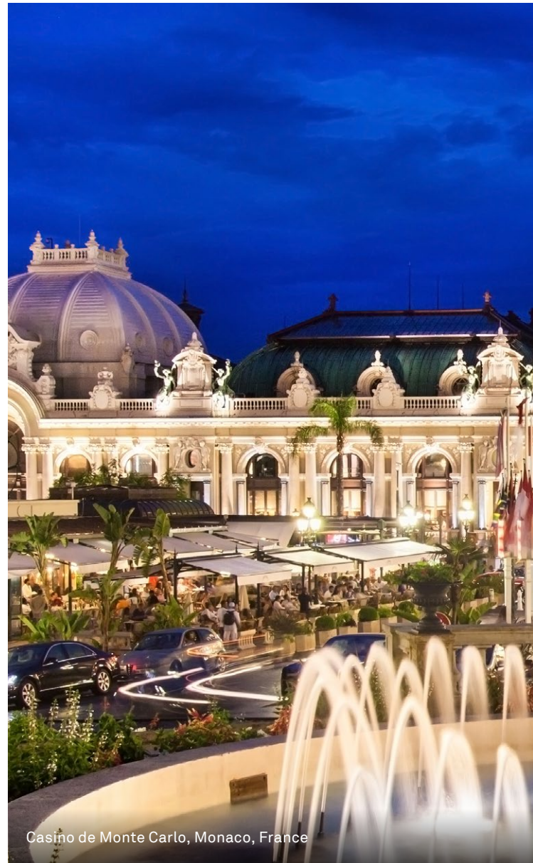
Casino de Monte Carlo, Monaco, France

Play golf in Portimão, wander through Tangier's ancient medina, or discover the cinematic charm of Cannes. Whatever your passion, there is a unique excursion tailored just for you.