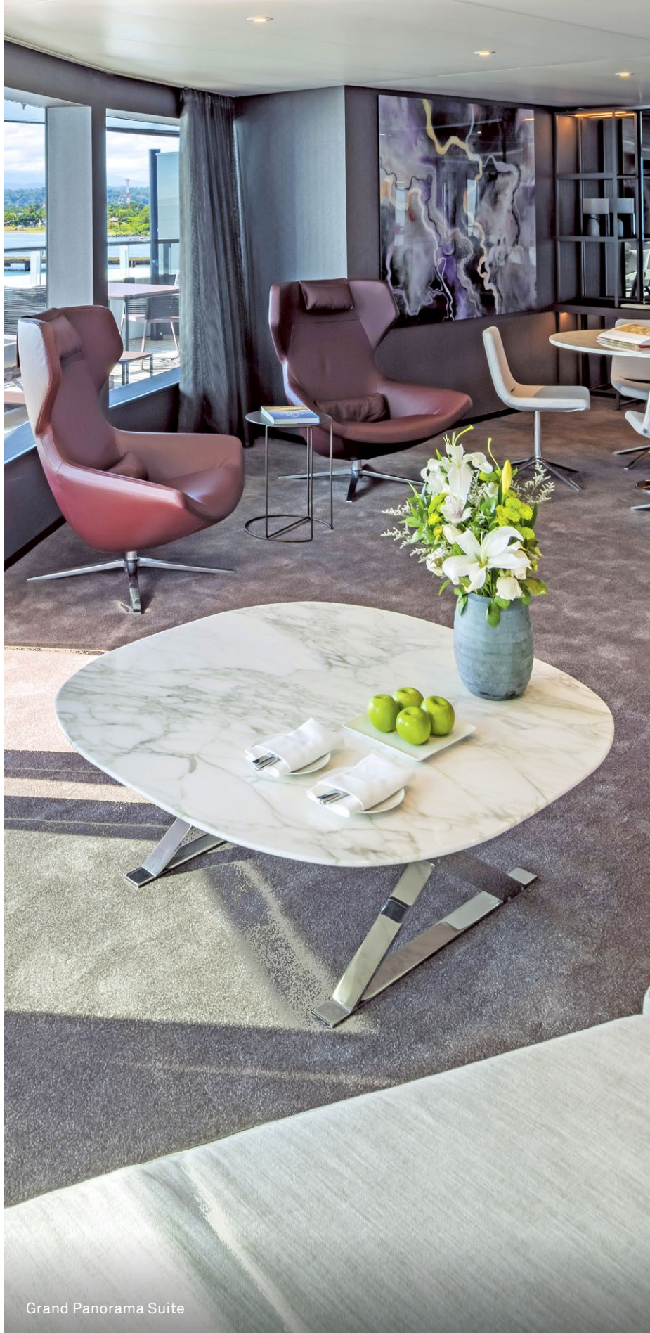
Grand Panorama Suite

In addition to the standard inclusions, our Spa, Panorama and Owner's Penthouse Suites feature steam showers, complimentary laundry service and luxurious baths. The Panorama and Owner's Penthouse Suites include VIP embarkation and disembarkation, access to private dining and more.