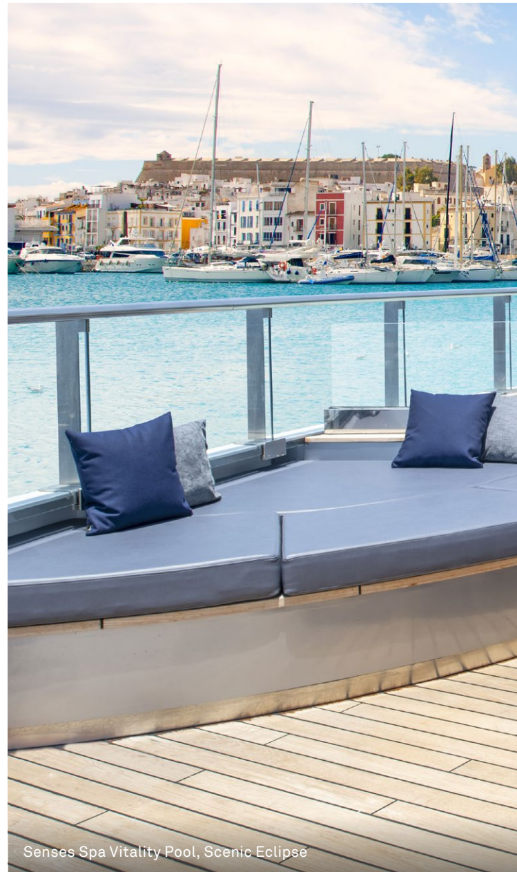
Senses Spa Vitality Pool, Scenic Eclipse

Throughout your voyage, a team of dedicated professionals will deliver an exceptional level of service. They will go to the Nth Degree to ensure you enjoy every moment.