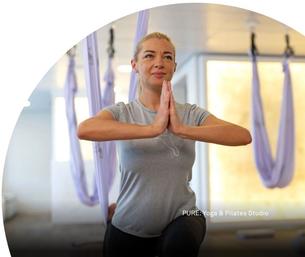
PURE: Yoga & Pilates Studio

Swift disembarkation and small excursion groups mean more time onshore exploring the jewels of Europe and the Mediterranean with a range of included Scenic Freechoice and Enrich experiences.