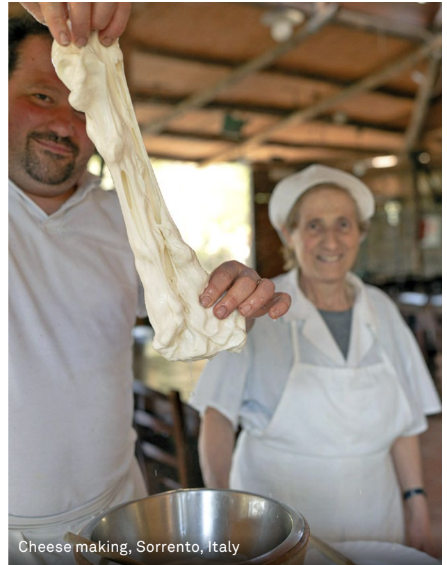
Cheese making, Sorrento, Italy

Our Mediterranean cruises take you right into the heart of contemporary southern European culture. Enjoy walking in the footsteps of movie stars in Saint-Tropez or Cannes, ruminating over the works at the Museo Picasso in Málaga or taking in some Balearic Beats at an exclusive club in Ibiza. We have the perfect onshore exploration to suit your interests and pace.