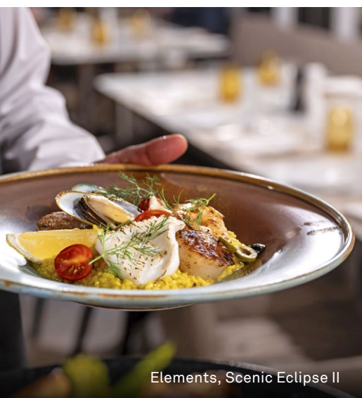
Elements, Scenic Eclipse II