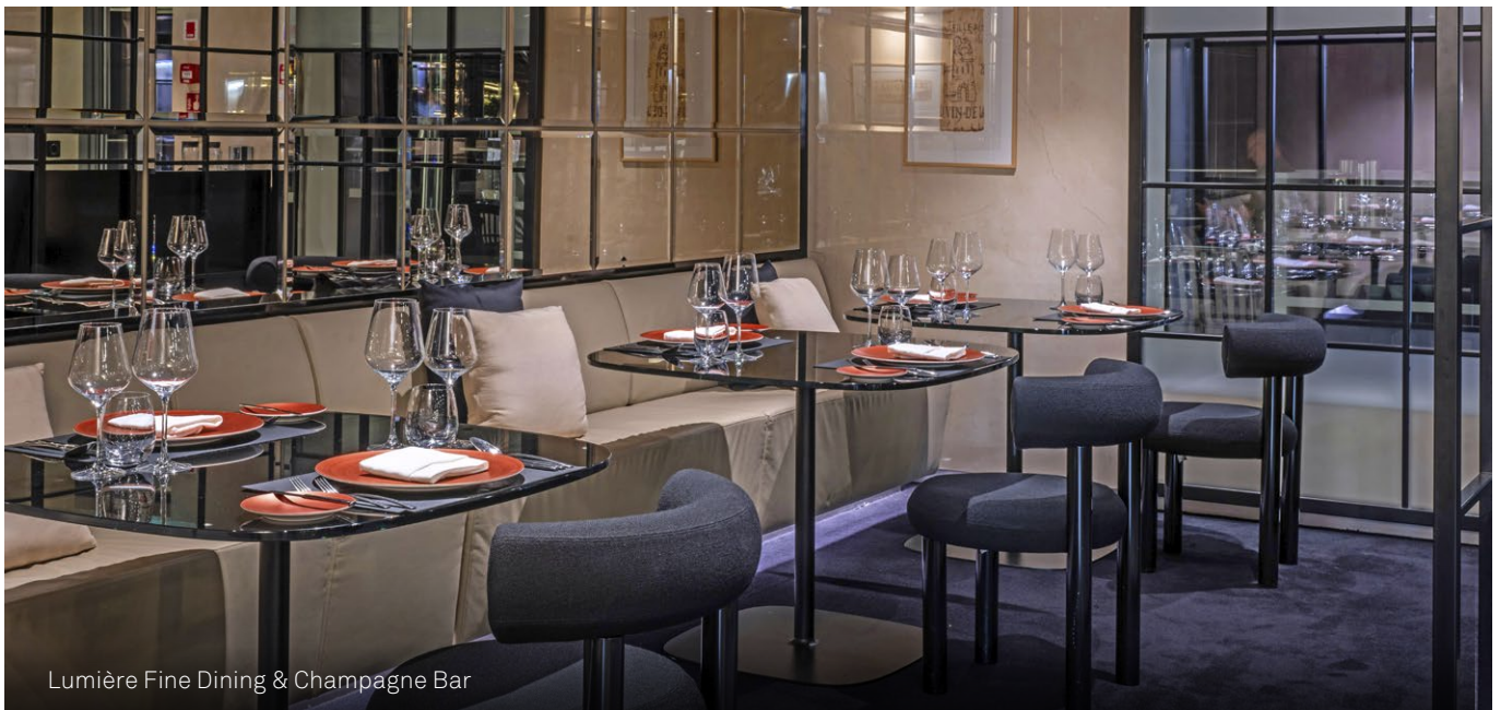
Lumière Fine Dining & Champagne Bar

Scenic Eclipse is the only Discovery Yacht growing its own micro-herbs, supporting our sustainability efforts. Using a hydroponic system with recycled water and light, we yield around 60kg annually, avoiding waste from ordering produce.