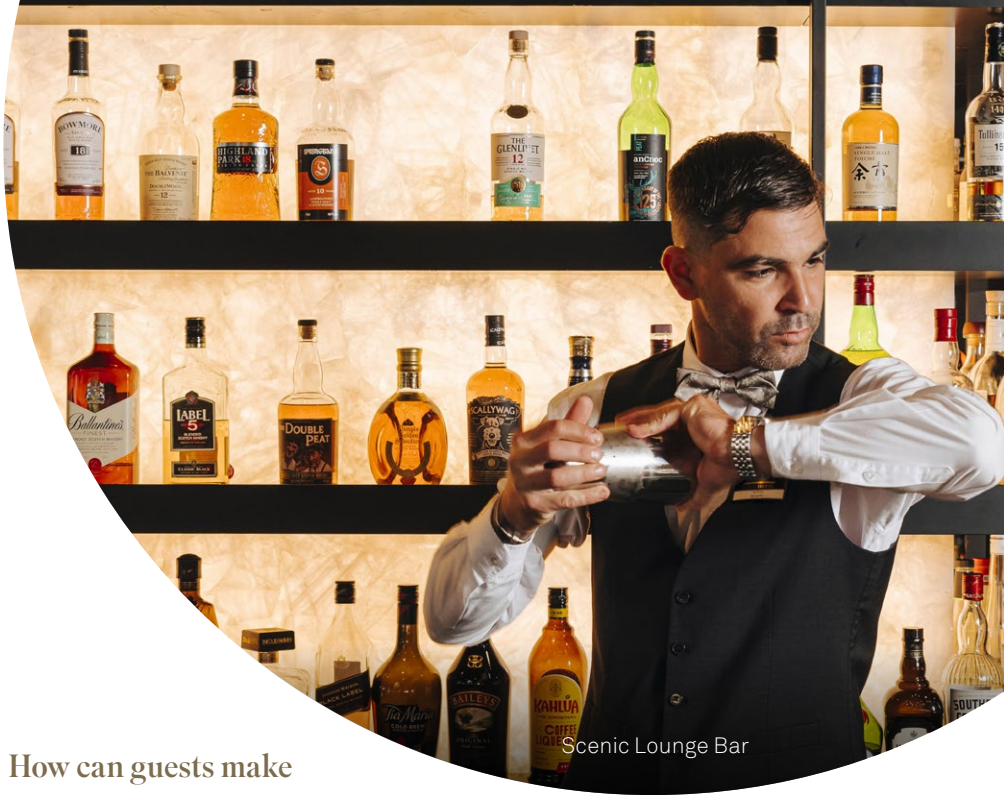
Scenic Lounge Bar