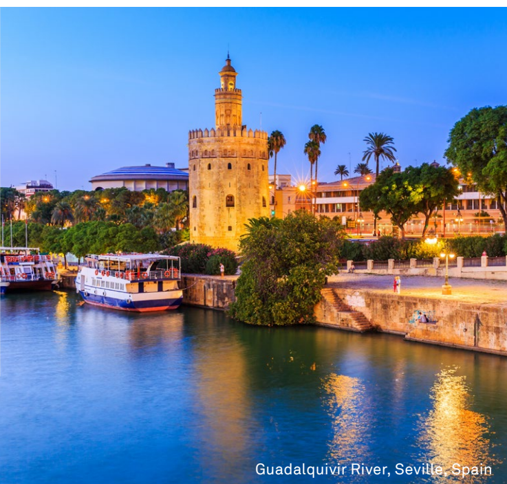
Guadalquivir River, Seville, Spain

Admire the breathtaking natural harbour of the Isle of Skye, glimpse seals and otters as you traverse the Sound of Mull, and discover Shetland Isles, the most northerly point of the British Isles. Be immersed in the many unique treasures of Europe and the Mediterranean just waiting to be revealed, all in the luxury of Scenic Eclipse.