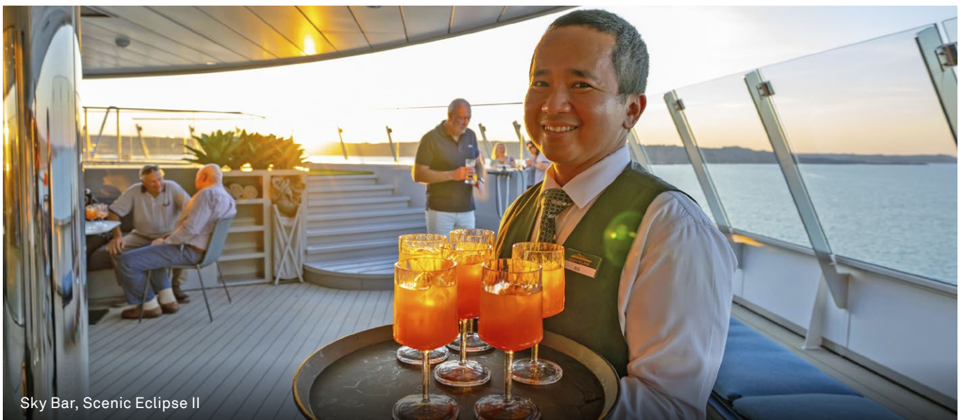
Sky Bar, Scenic Eclipse II